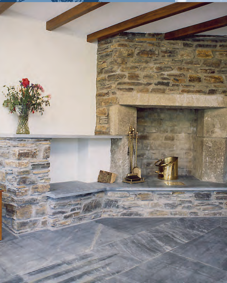
▲ Traditional Random Slab flooring, Frame Sawn finish - newly laid and before treatment.