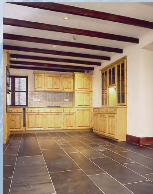
▲ Traditional Random Slab flooring, Frame Sawn finish after treatment.