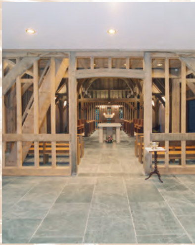
▲ Traditional Random Slab flooring, Frame Sawn finish, newly laid and before treatment.