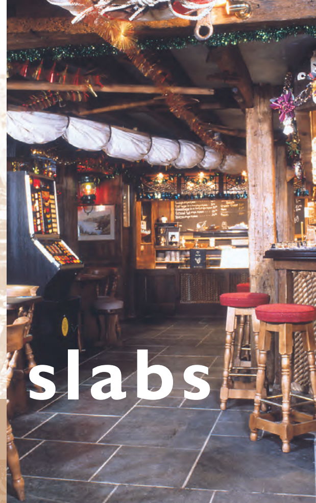
▲ Frame Sawn flooring at Shipwrights Inn, Padstow, Cornwall. An unusual layout - completely random

FROM THE WORLD RENOWNED DELABOLE SLATE QUARRY