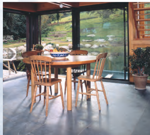
▲ Uniform sized Frame Sawn slabs, laid to a regular pattern at Chagford, Dartmoor.