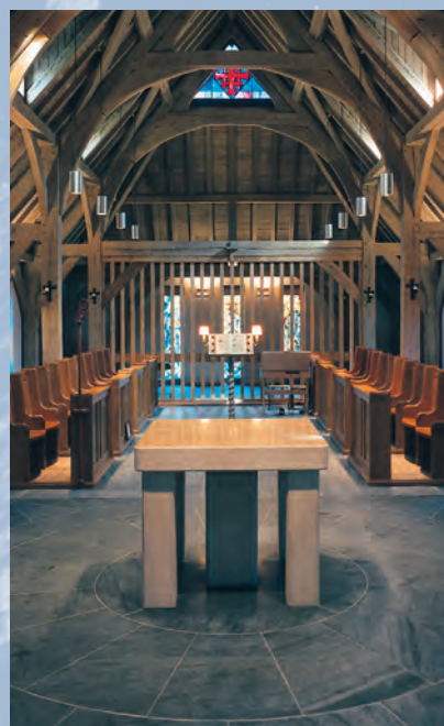
▲ Frame Sawn flooring slabs at Elmore Abbey, Newbury, Berkshire.